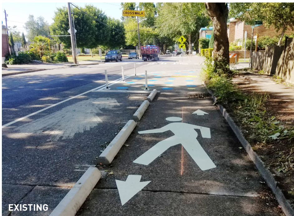
Temporary walkway where we'll build the permanent concrete sidewalk

NEW! We're also planning to incorporate decorative street designs into this project – see back for details!